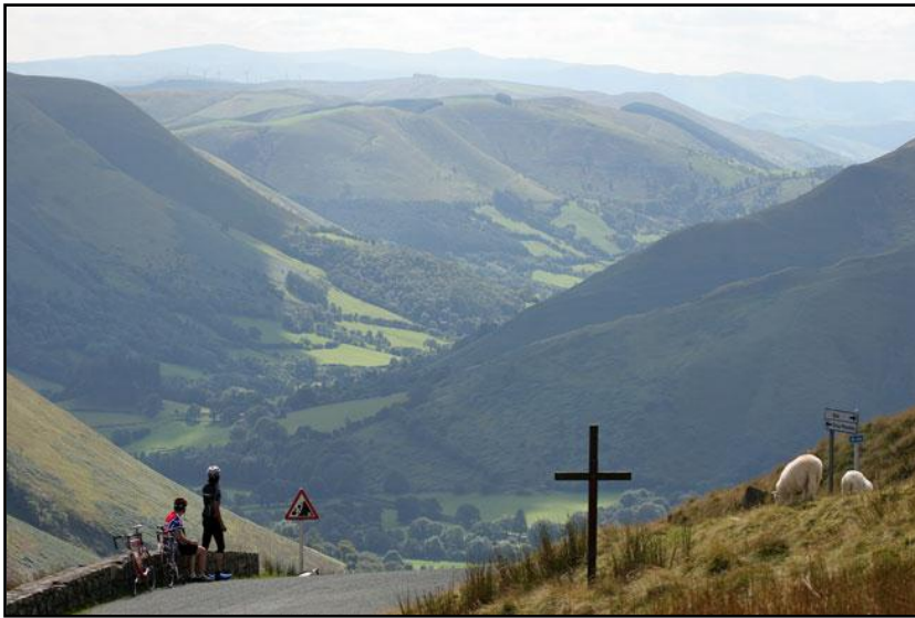
The beautiful hills of Dinas Mawddwy Merionethshire North Wales